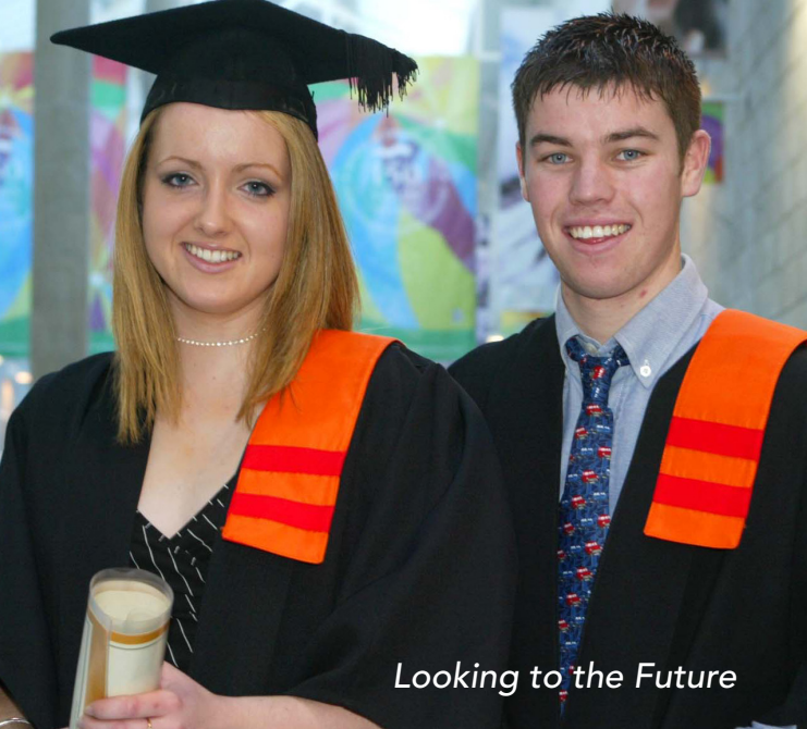
Looking to the Future